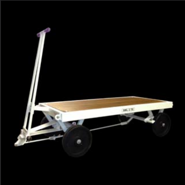
4-Wheel Deck Trolleys