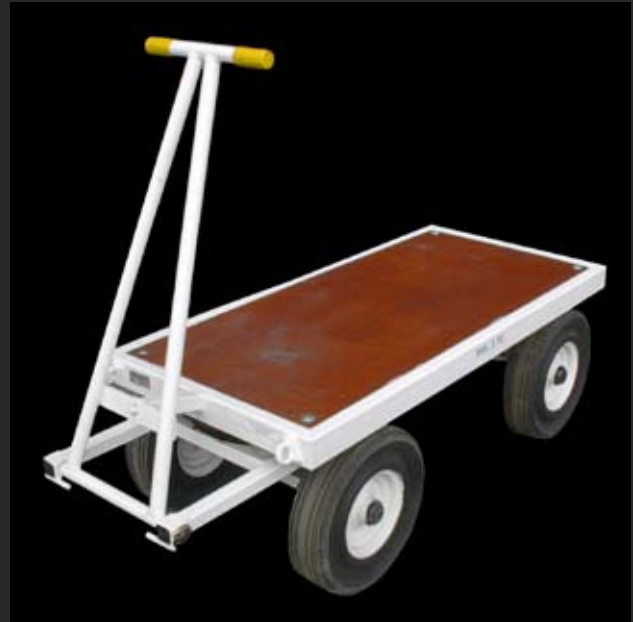
4-Wheel Turntable Trolleys