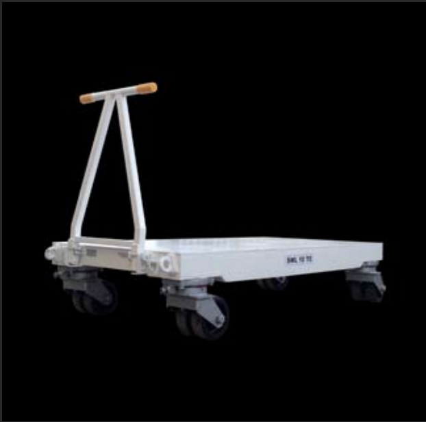
Swivel Castor Trolleys